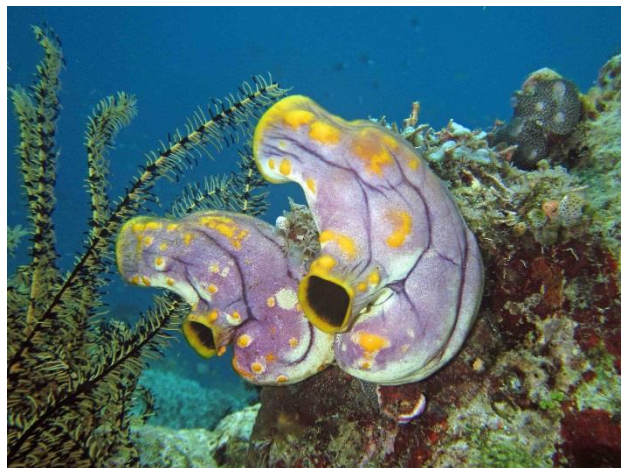
Sea Squirts