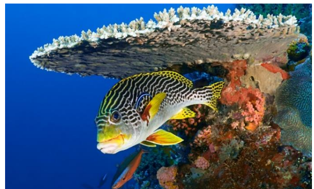
From top: Komodo Dragon, Fraser's Dolphin, Oriental Sweetlips.