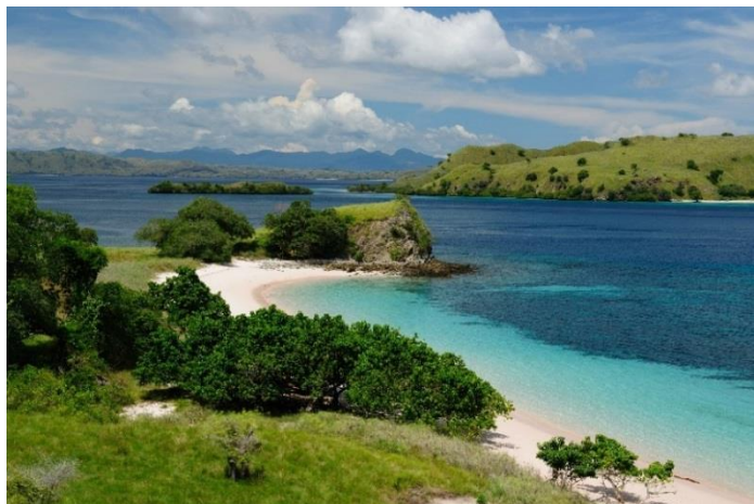
Komodo National Park

However, the main attraction on land will undoubtedly be the Komodo Dragon. This fearsome lizard can grow to over 3m (10') in length. It is confined to Komodo and Rinca Islands (and some small surrounding areas) and we hope to go ashore on both.