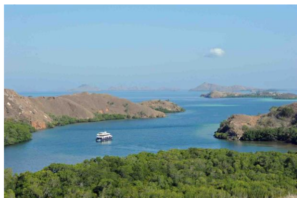
Komodo Dragon and MV Mermaid off Rinca